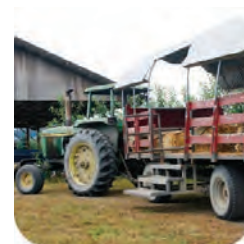
Farms and Ranches