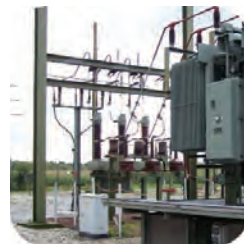
Power Transmission and Distribution